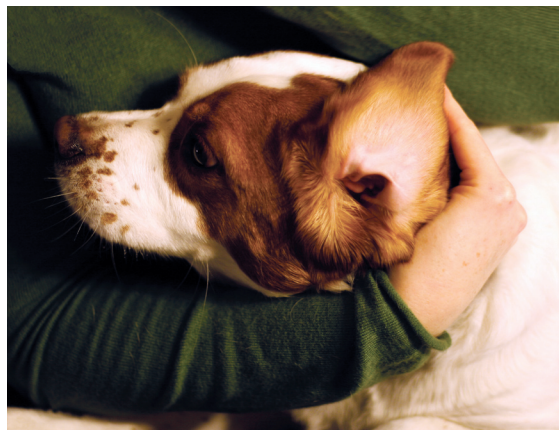
Use one hand to hold the ear flap back so that you can treat the ear with the other.