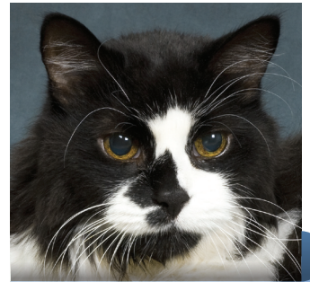
Healthy senior cats should see the veterinarian every 6 months.

Just as with people, it’s important for feline patients to see their doctors more frequently as they age. During a senior wellness exam, your veterinarian will screen your pet for a variety of age-related health concerns. A thorough senior wellness exam is designed to: